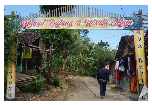
Figure 5. Welcome Sign on Sikempul and Silodong Cave

The results of geosite and geomorphosite analysis in Table 1 show that Sikempul and Silodong Caves have the scientific and intrinsic values of 50%, educational values of 62,50%, economical values of 66,67%, conservation values of 87,5%, and added value of 50%. Overall, Langse Cave has a feasibility rate of 63,33%, eligible as a geotourism object.