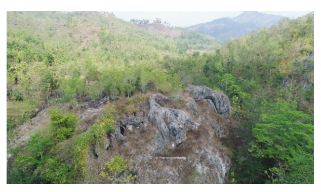
Figure 7. Batur Tewaton Summit