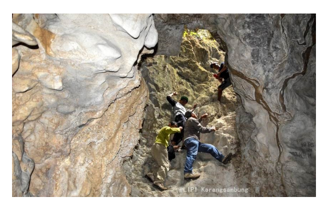
Figure 6. Ornaments inside Sikempul Cave