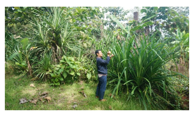
Figure 8. Pandanus Plant

The results of geosite and geomorphosite analysis in Table 1 show that Kalisana Artificial Lake have the scientific and intrinsic values of 25%, educational values of 30%, economical values of ekonomi 33,33%, conservation values of 87,5%, and added value of 50%. Overall, Kalisana Artificial Lake has a feasibility rate of 42,67%.