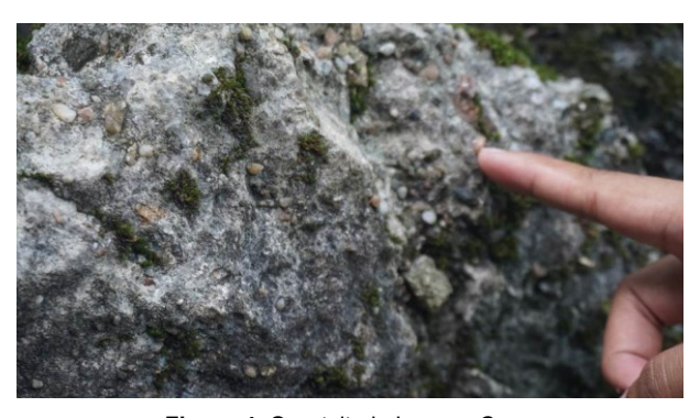
Figure 4. Quartzite in Langse Cave