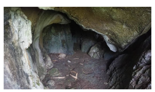
Figure 3. Langse Cave