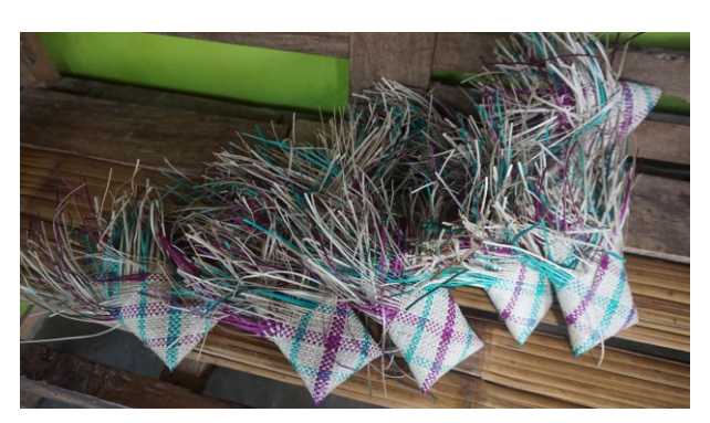
Figure 9. Souvenirs from Pandanus