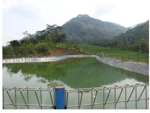
Figure 10. Kalisana Artificial Lake