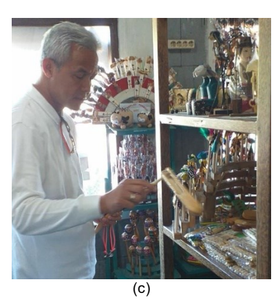
Figure 4. (a) in Rikrok; (b) Tourist Mancanegara in Galery; (c) Domestic Tourist (Governor of Central Java:Ganjar Pranowo) been to Gallery Rikrok