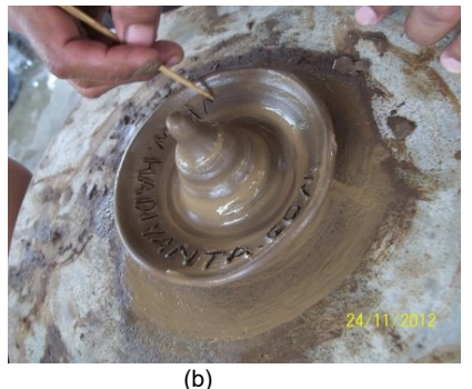
Figure 3. (a) Making Pottery; (b) Pottery Design