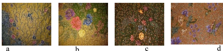
Figure 1. Batik Demak Peranakan Motif Flora (a,b) and Fauna (c,d)

Information related to Demak Batik is very vague. This can be understood because Demak was once the center of government in the 16 th century, then in the 17 th century, its position shifted to become a vassal area of the Islamic Mataram Kingdom [13]. Because it is not the center of batik making [1], this situation causes the habit of making batik to decline. Demak Batik is traced based on information stating that Demak Batik was produced by Peranakan Chinese [3, 11, 12] in Wedung Village until the end of the 20 th century [4, 11]. The motif of Demak Batik produced by Peranakan Chinese is very complicated. Most of the motifs are flowers with a full background. Birds, butterflies, and small animals are also found in the Peranakan batik. Although it is a coastal batik, Demak Batik is different from Pekalongan Batik. The colors used in Demak Batik tend to be soft [11]. The following examples of Peranakan Demak Batik motifs illustrate flora and fauna obtained from several sources [11, 12].