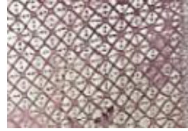
Figure 2. Demak Scales Batik Motifs (Source: Researcher Documentation, 2022)