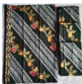
Motif Parang Miring