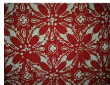
Motif Sapit Urang