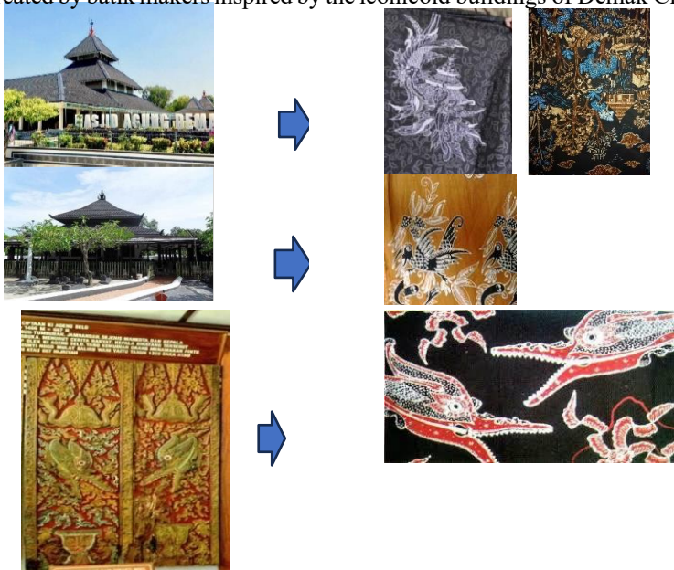
Figure 3. Cultural Environment and Creation of Demak Batik Motifs

Demak is an old city, the former capital of the first Islamic Kingdom in Java [18]. Therefore, the cultural development of Demak City cannot be separated from the history of the Demak Kingdom. Icons associated with Demak as an old city can be shown by the existence of kuna buildings that still exist today such as the Great Mosque of Demak, Sunan Kalijaga Cemetery Complex [19], and Poo An Bio Temple [20]. Based on old buildings as Demak markers, the creation of batik motifs emerged from Demak batik makers. The following is an example of Demak Batik motifs created by batik makers inspired by the iconic old buildings of Demak City.