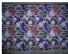
Motif Ulam Segaran

environment can be classified as animal motifs, plant motifs, and natural motifs. Here is an example of Demak Batik inspired by animal, plant, and natural motifs.