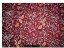
Motif Belimbing Mlatiharjan