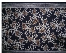
Motif Semangka Tegalan