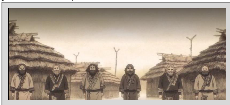
Fig. 1. The Ainu Patriarchal Society [8]

In the real world, the Ainu people occupy most of Hokkaido island. They are a group of people with their own life and cultural characteristics. In Anime Golden Kamuy , the Ainu land is depicted as a snowy place surrounded by forest with traditional thatched houses. The Ainu, also known as the Aborigines of Japan, are described as a group dominated by men. This confirmation is shown by depicting the men of the Ainu tribe, who are dressed in traditional clothing against the background of the houses of the tribe's inhabitants. The following picture is interpreted as a symbol of a traditional community under men's leadership. Pictures of Ainu village men with Ainu appearance clearly show the presence of a patriarchal system in the community.