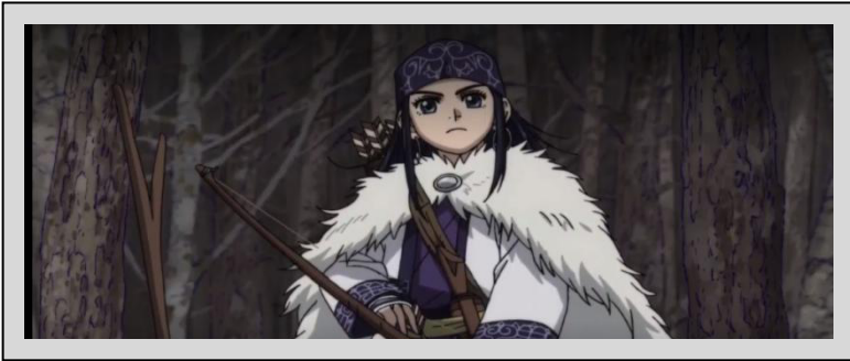
Fig. 2. The figure of Asirpa

was not like ordinary women. She stood bravely, holding a bow and arrows, which men usually own.