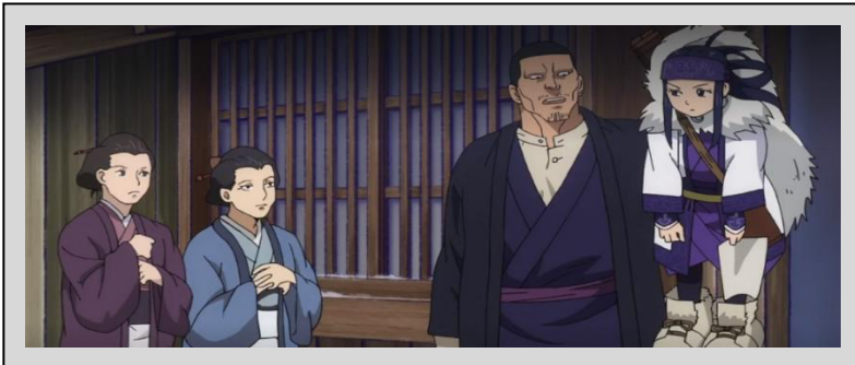
Fig. 3. Big man showing his dominance in front of women

Besides the physical description of a tough woman, Asirpa's courageous existence can also be seen in several scenes in the anime, illustrating how she fearlessly confronts people who underestimate her existence. One of the scenes is when she confronts the male innkeeper.