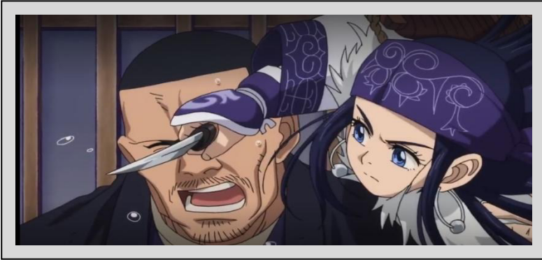
Fig. 4. Asirpa's resistance to domination and intimidation

As a physically challenging woman, Asirpa is also described as intelligent and has good communication skills. This ability make her goals can be adequately achieved. This can be seen in several scenes that illustrate Asirpa's persistence and business intelligence when convincing the men around him to help achieve her goals.